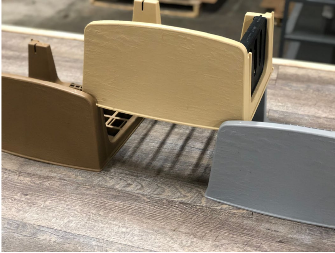
3 different Colors!