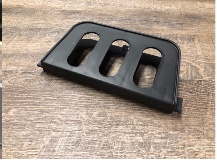
Snap-in Side Rails for Corners and Curves