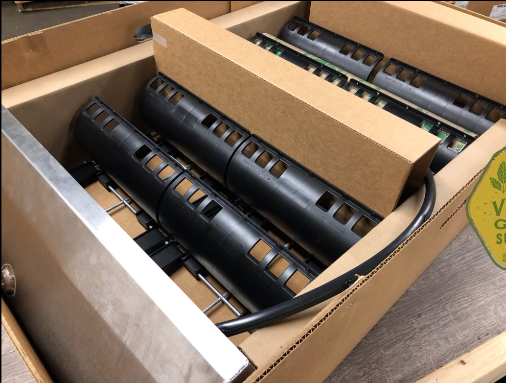
The Box Has Arrived